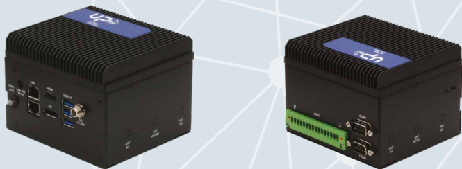
1x UP Squared Pro Edge